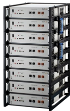
R-Bracket hold up to 8*E-BOX 48100R