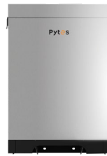
R-BOX-NEMA3 hold up to 2*E-BOX 48100R