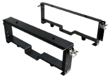
F. & B. Bracket hold up to 1*E-BOX 48100R, Stack up to 4*E-BOX 48100R