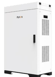
Forest RB Plus hold up to 6*E-BOX 48100R