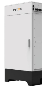
R-BOX-OC hold up to 4*E-BOX 48100R